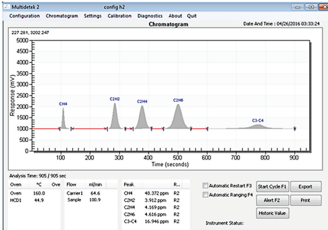
Figure 3: Chromatogram of trace CH 4 , C 2 H 2 , C 2 H 4 , C 2 H 6 & C 3 + in oxygen matrix